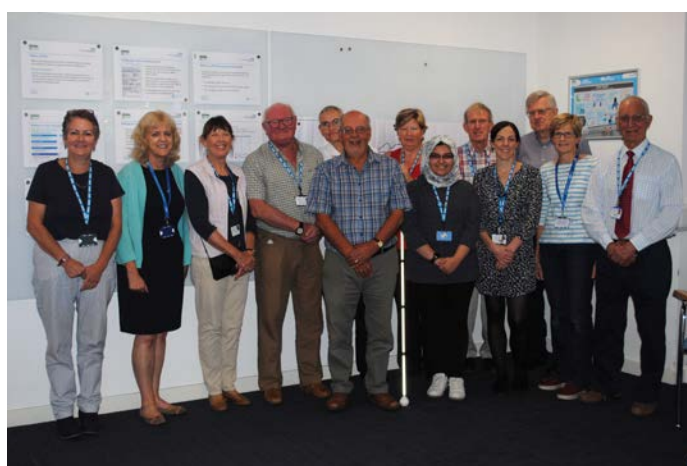
Group of Governors (2019)