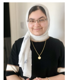
Aishah Farooq Youth Involvement Group