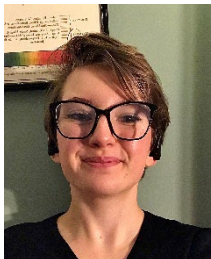
Maisy McCollum Youth Involvement Group