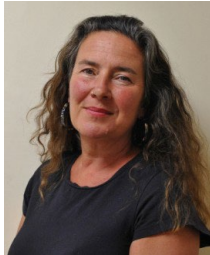
Fi Hance Bristol City Council