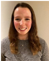
Grace Burn Youth Involvement Group

We are supportive respectful innovative collaborative. We are UHBW.