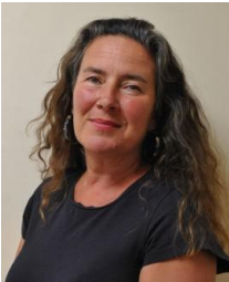
Fi Hance Bristol City Council