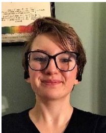
Maisy McCollum Youth Involvement Group