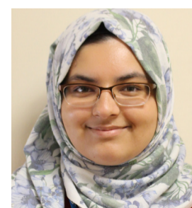
Aishah Farooq Youth Involvement Group